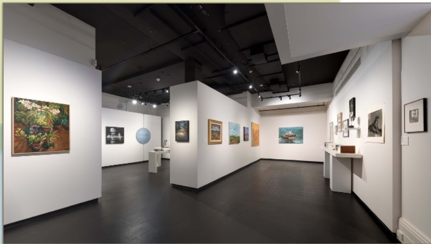
Bayside Local' 2022 installation view.

For further information and to apply visit: https://bit.ly/3BBFJdn